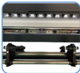
High Speed feeding and taking up system