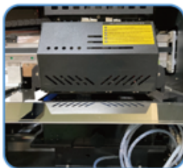
Auto motor cleaning system