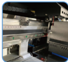
Adjustable carriage height