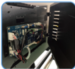
Stable Hoson board